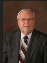
Ron Fletcher Place #1