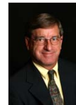
Bobby D. Lane Mayor