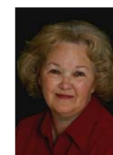
Cathy Chilcote Place #4