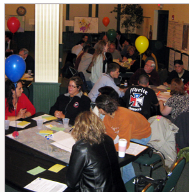
Comprehensive Plan Public Meeting

Infrastructure and transportation needs created by the growth of the City were noted as the key challenges to Buda over the next 10 years.