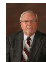
Ron Fletcher Place #1